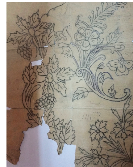
A sketch from Anna's grandfather