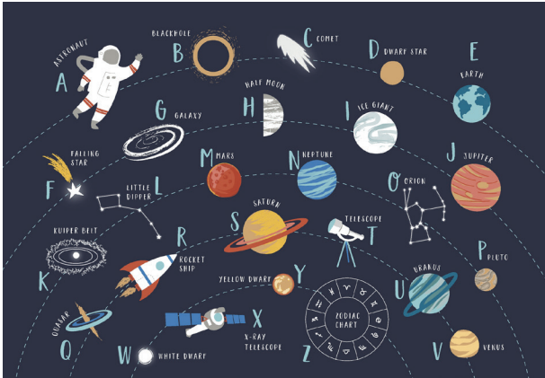
SPACE ALPHABET by Teju Reval